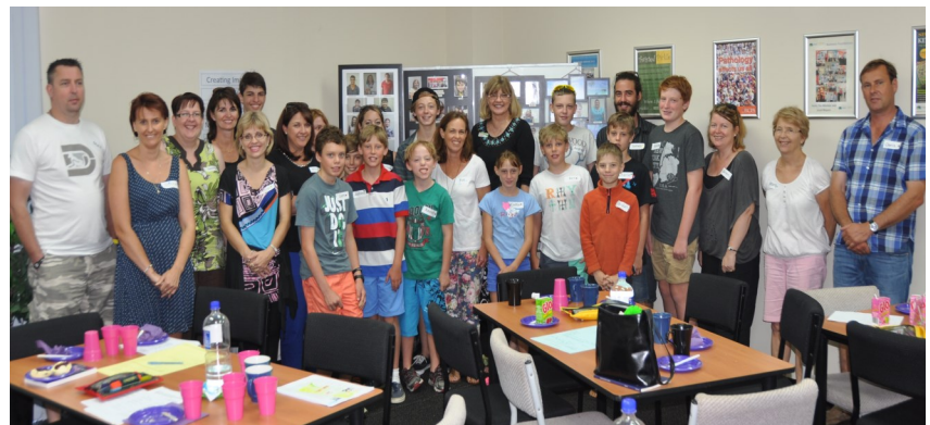
Some of the participants at our Get Together

The junior members also enjoyed some group activities plus the BIG bonus of getting to know each other and making friends.